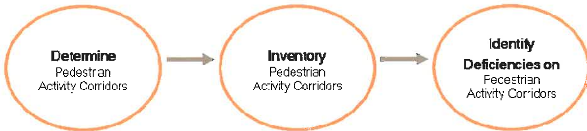
Figure 2: Self-Evaluation Process

Pedestrian Activity Corridors were identified, as specified in the ADA, as walkways serving government facilities, transportation, place of public accommodation, and places of employment. Specifically, the criteria are shown in the below list alphabetically: