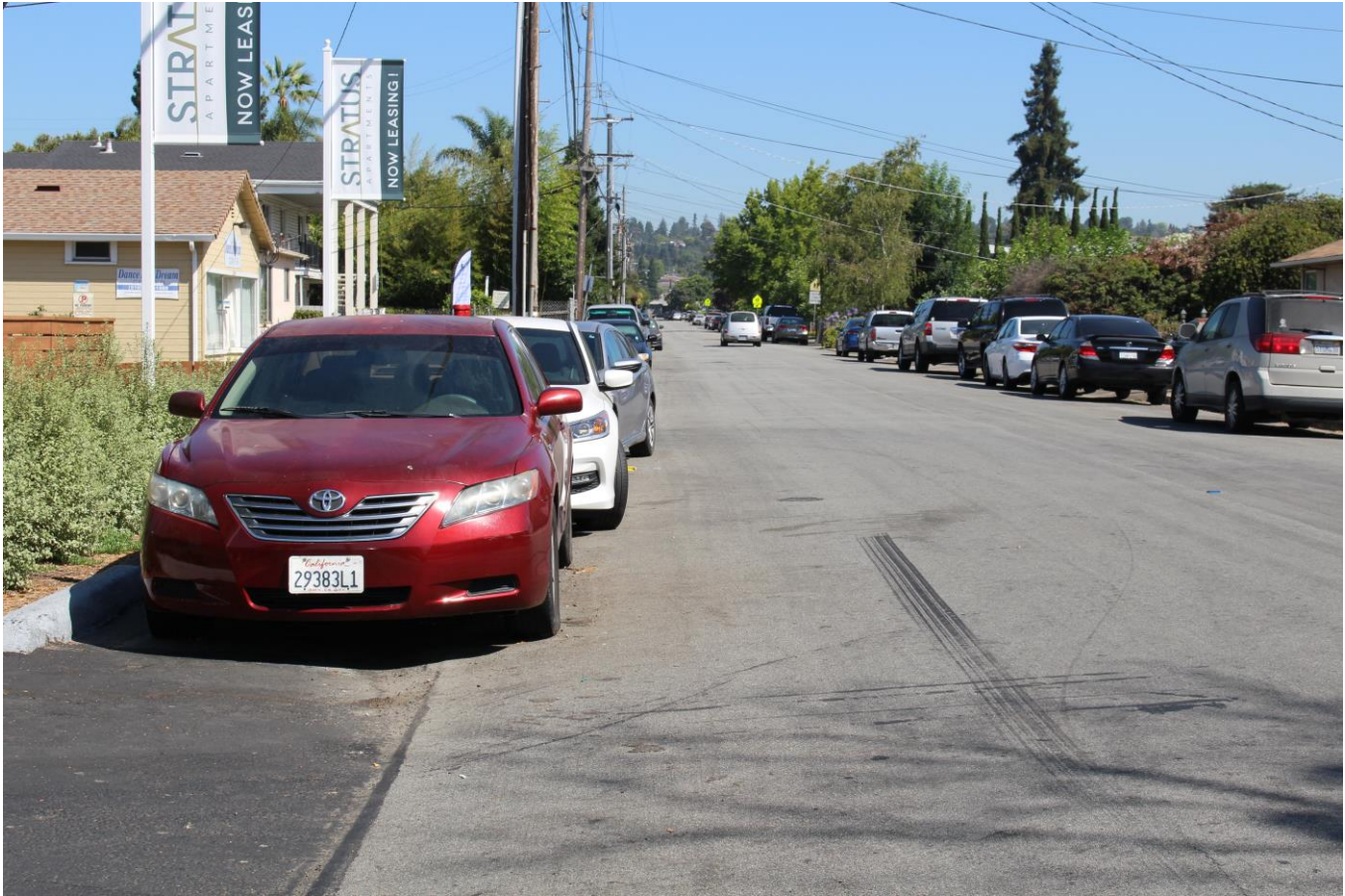
Anita Avenue near Castro Valley Blvd: Looking North