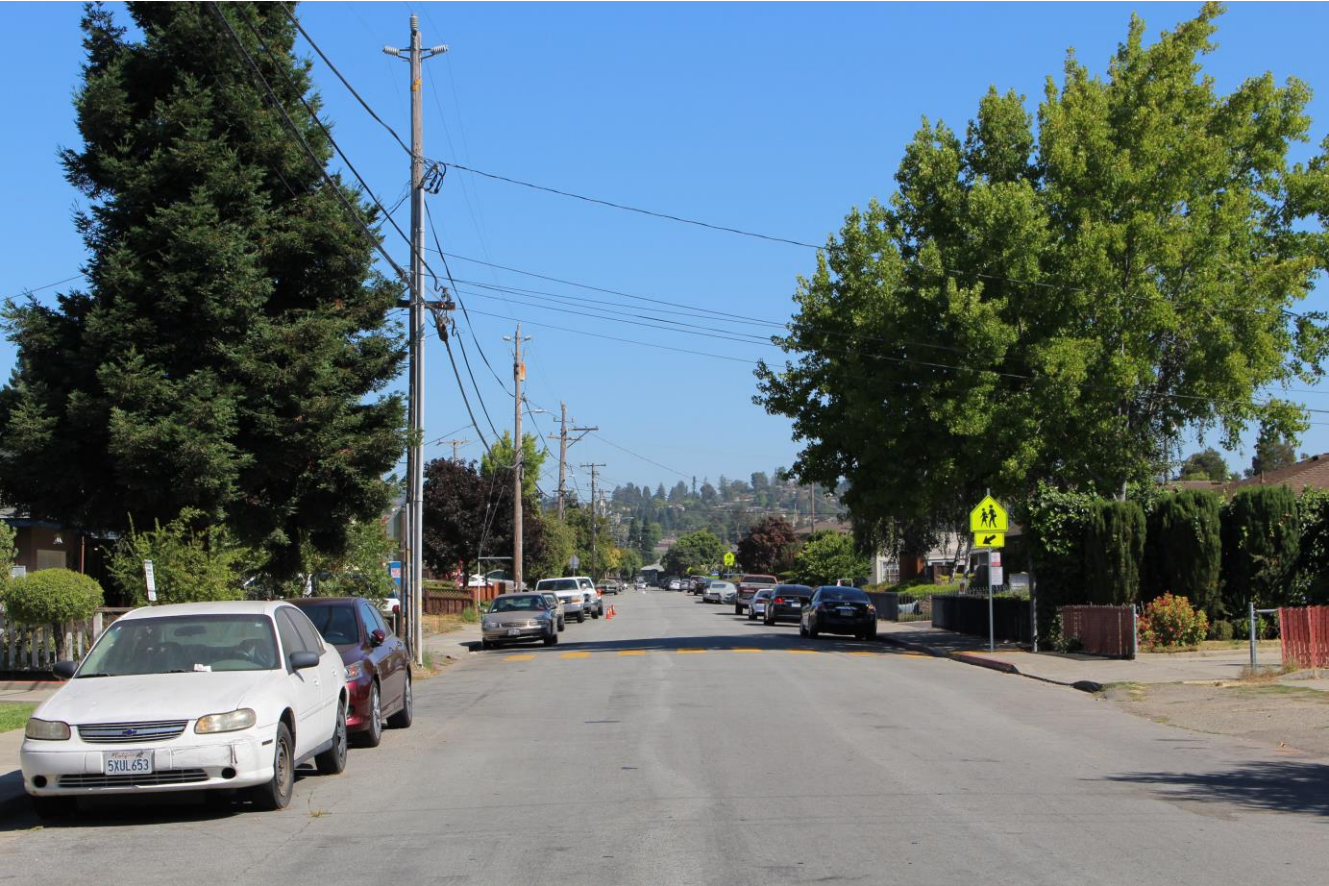
Anita Avenue at Rear Entrance to Castro Valley Elementary School: Looking North