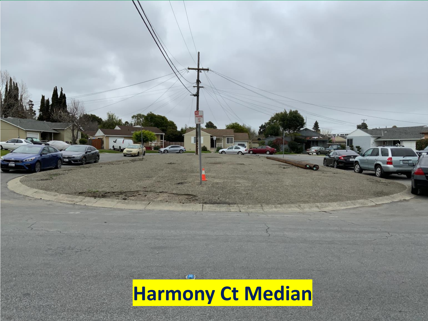
Harmony Ct Median