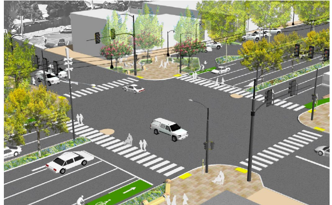
Intersection of Hesperian Boulevard and Paseo Grande

No construction activities will be conducted during the time period from Thanksgiving to New Year's Day.