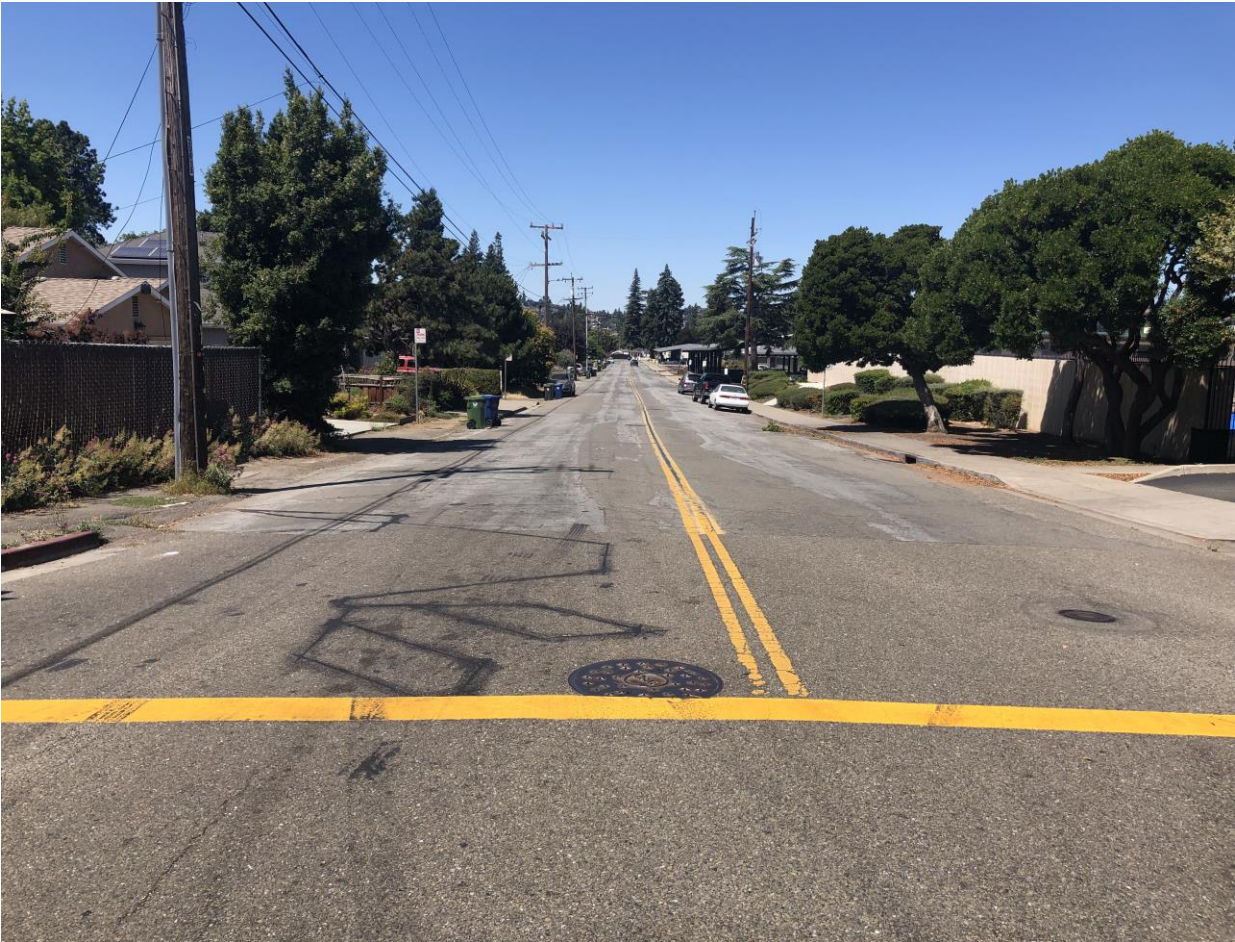
Mabel Avenue at the intersection with Redwood Road: Looking West