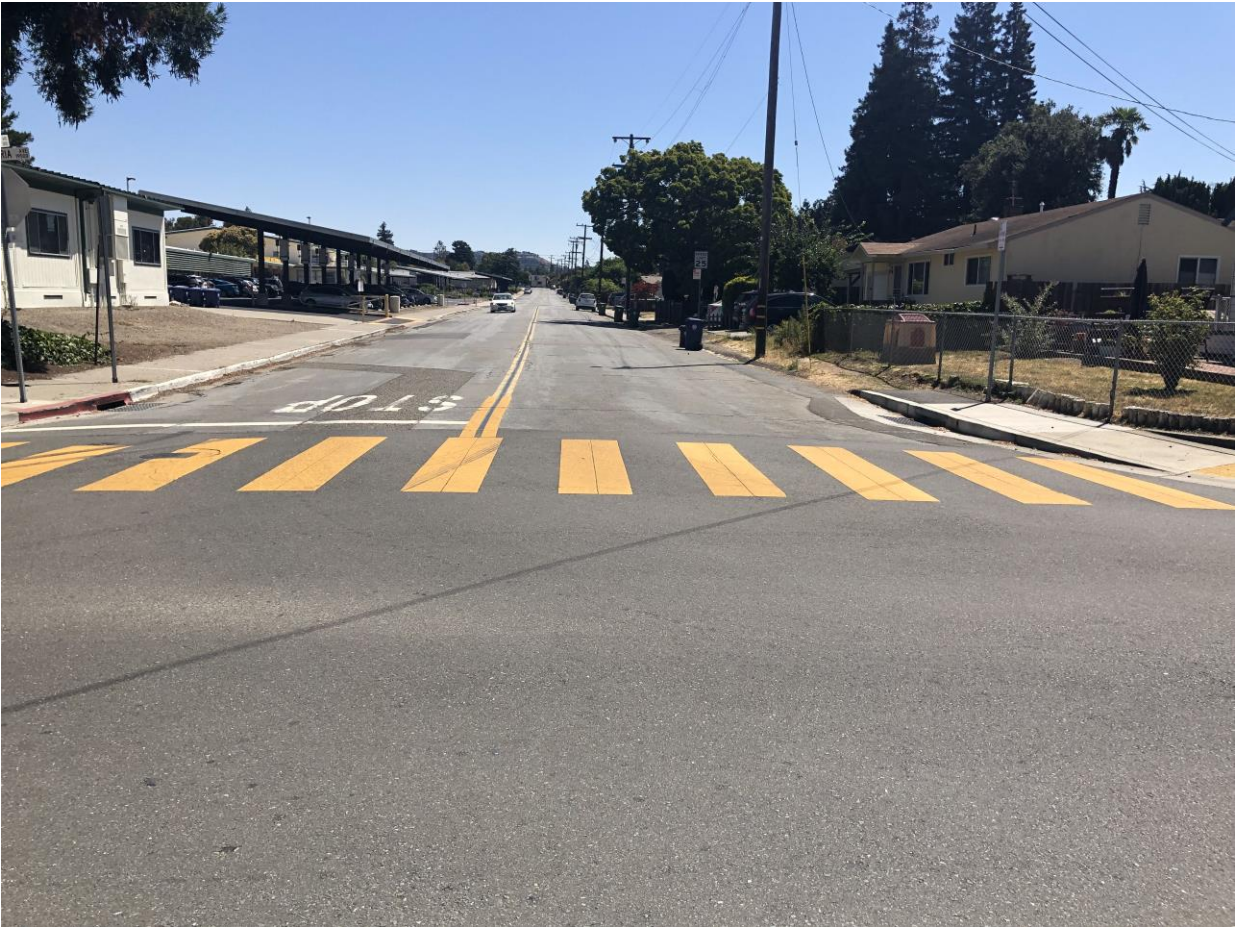
Mabel Avenue at the Intersection with Santa Maria Avenue: Looking East