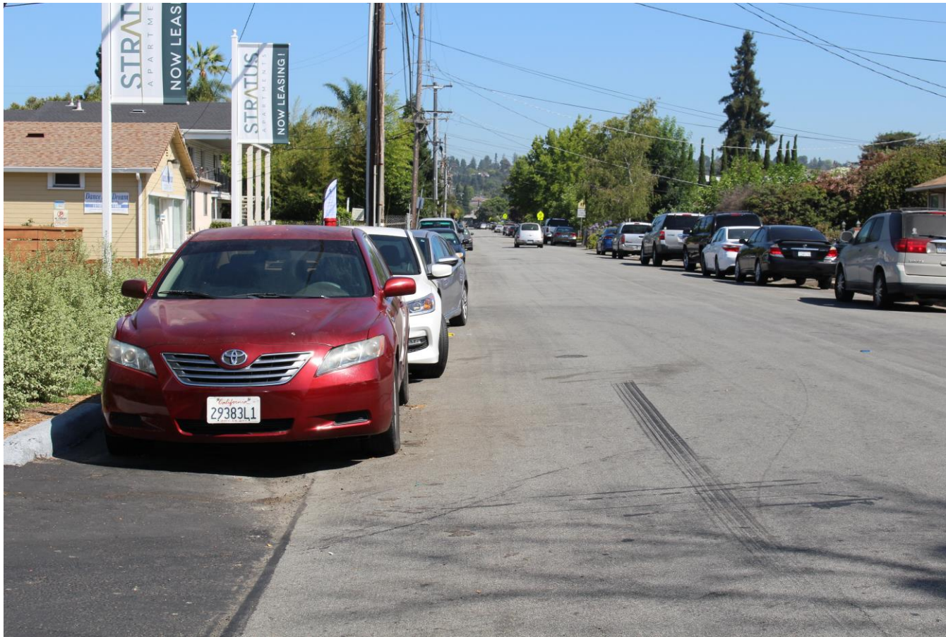
Anita Avenue near Castro Valley Blvd: Looking North