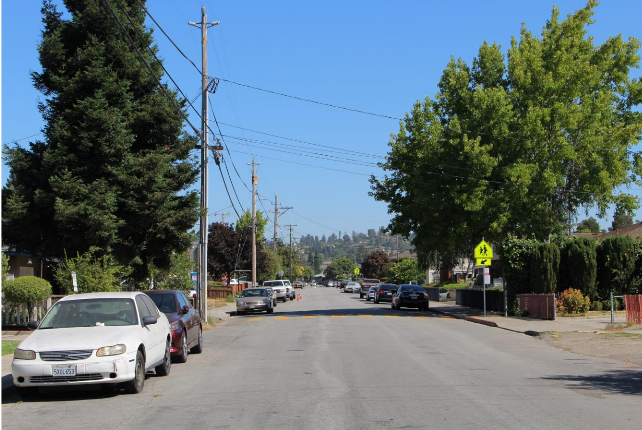
Anita Avenue at Rear Entrance to Castro Valley Elementary School: Looking North