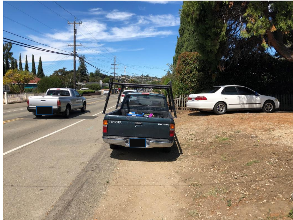
Looking West near Summer Place