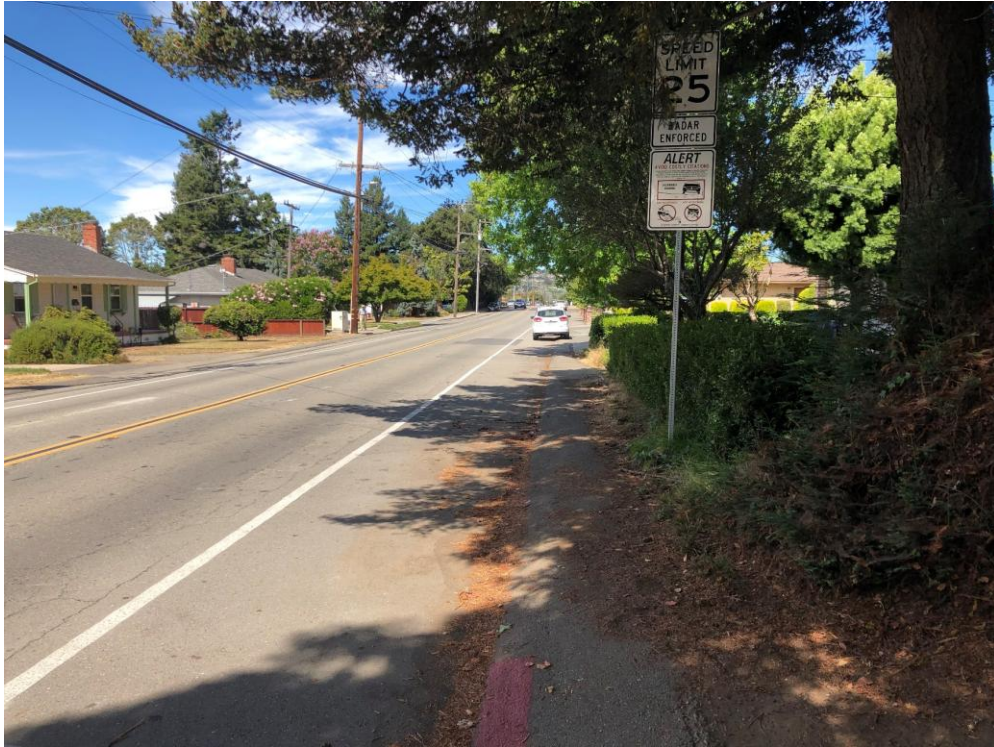
Looking West near Redwood Rd