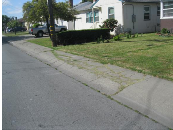
15921 Via Alamos, San Lorenzo