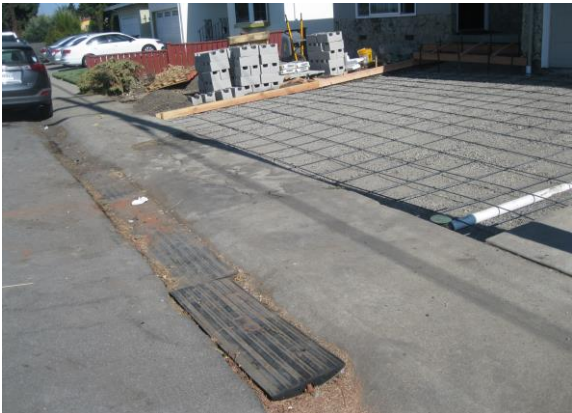
19216 Ricardo Ave., Hayward