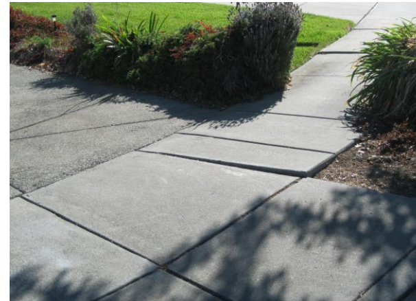
25736 Cloverfield Ct., Castro Valley