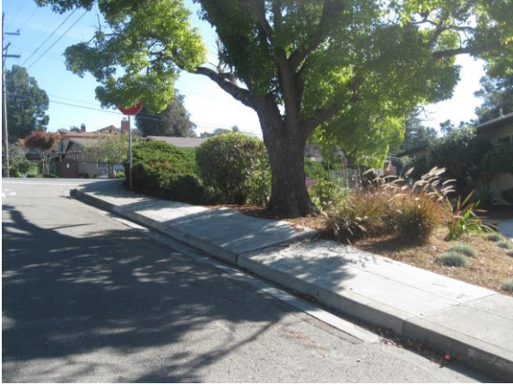
3295 Bridle Dr., Hayward