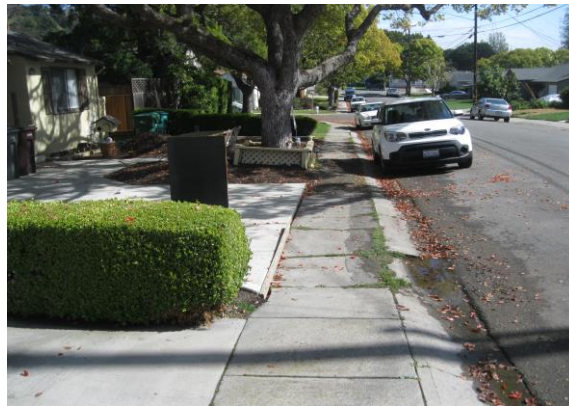
16150 Windsor Dr., San Leandro