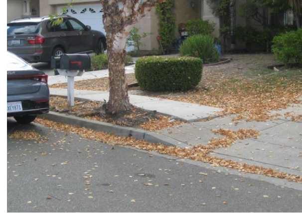
5288 Glass Brook Ct., Castro Valley