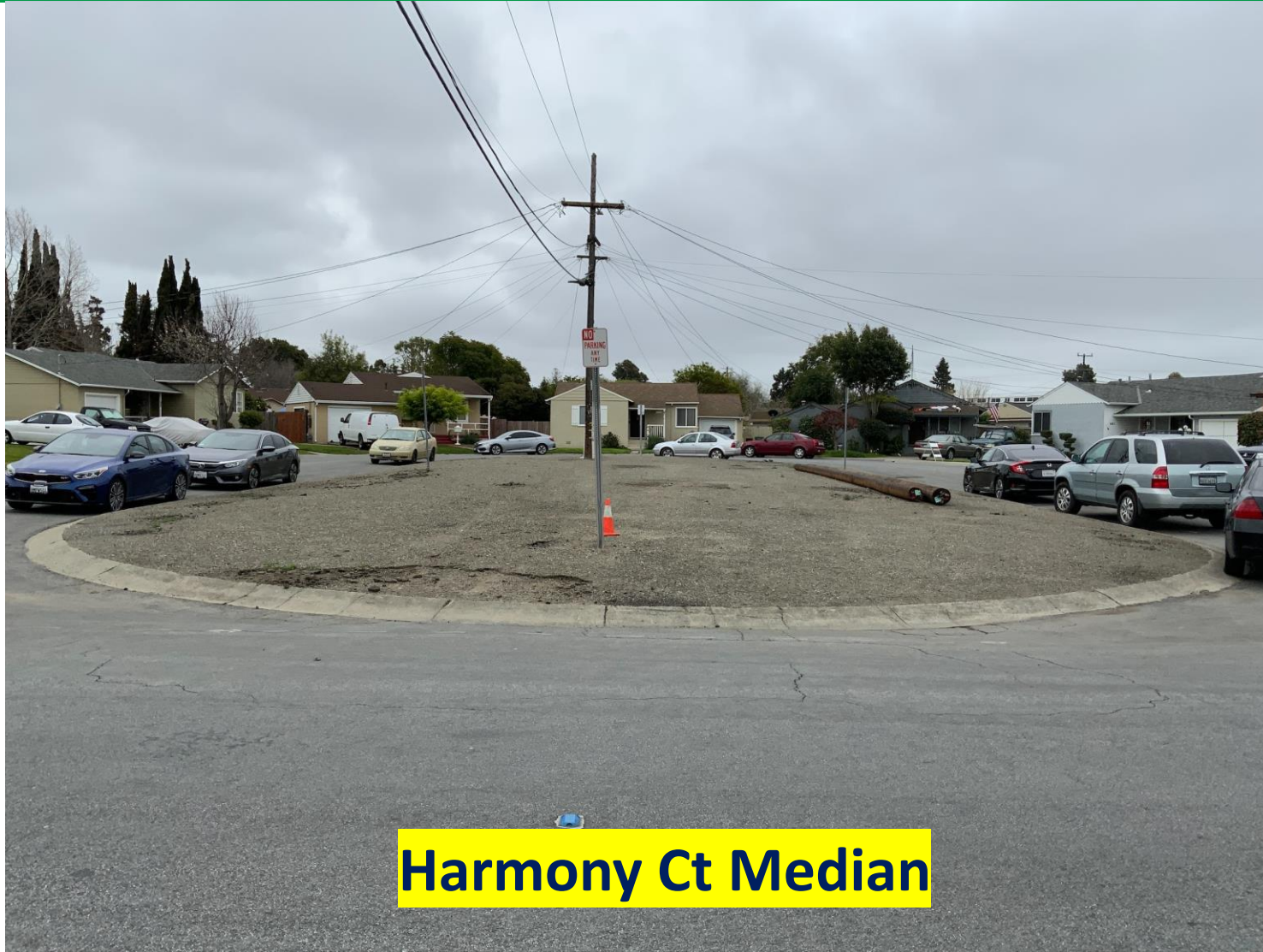
Harmony Ct Median