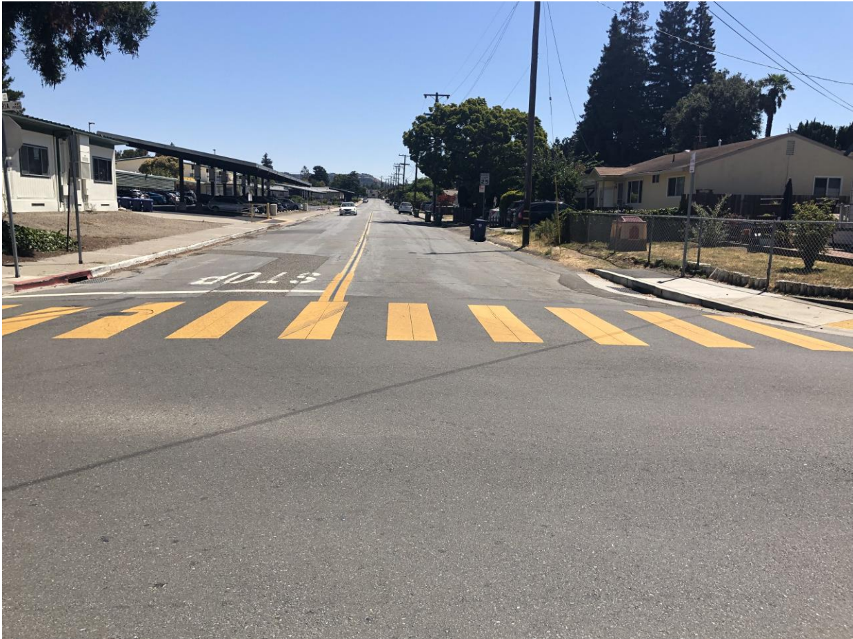
Mabel Avenue at the Intersection with Santa Maria Avenue: Looking East