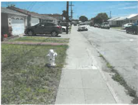
1373 Via El Monte, San Lorenzo