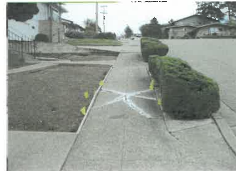
5190 Crane Ave, Castro Valley