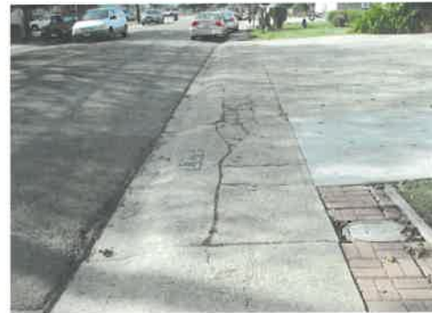
927 Bockman Rd, San Lorenzo