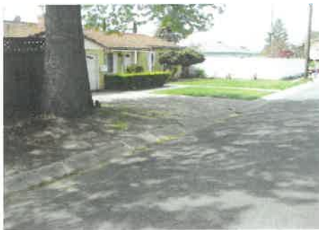
2715 Jamison Way, Castro Valley