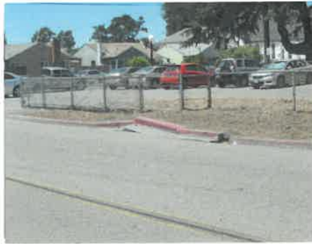
2196 Usher St, San Lorenzo