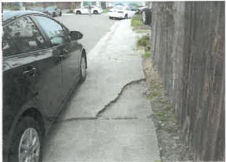
22134 North 5 th St, Castro Valley