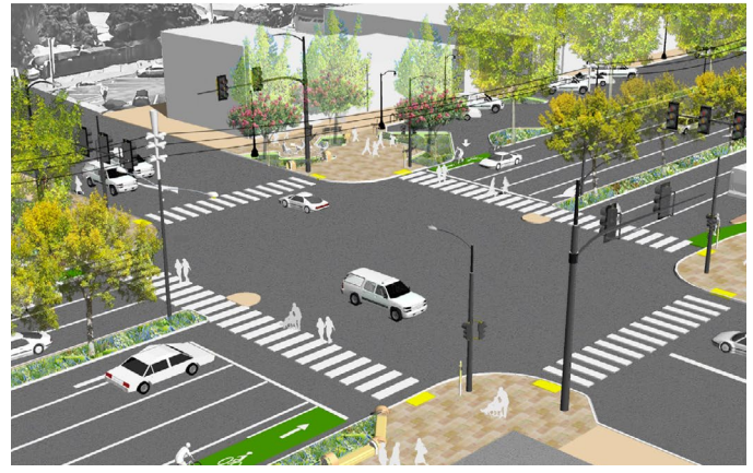
Intersection of Hesperian Boulevard and Paseo Grande

No construction activities will be conducted during the time perioud from Thanksgiving to New Year's Day.