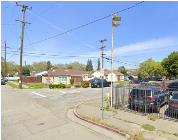
Alisal Ct / E. Lewelling Blvd