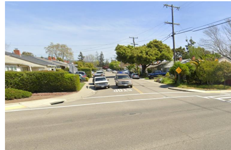
Lake Chabot Rd / Barlow Dr