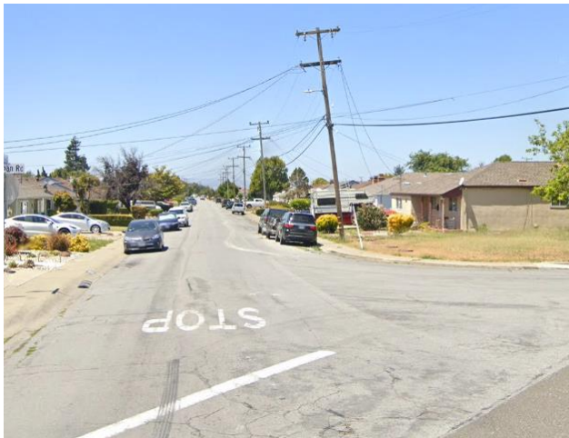
Bockman Rd / Keller Ave