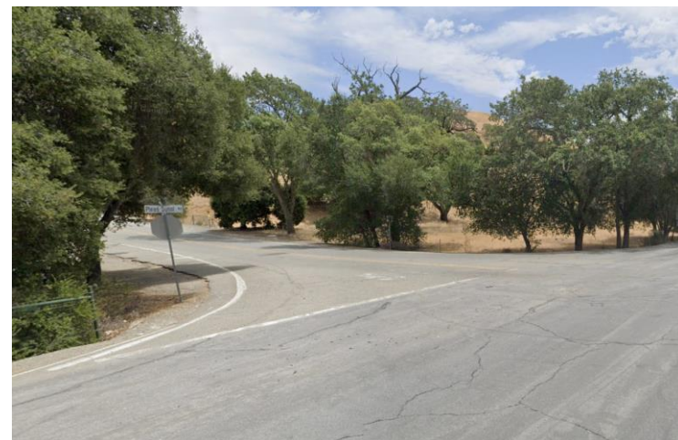
Koopman Rd/ Pleasanton Sunol Rd