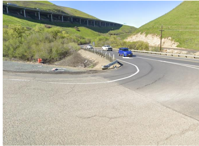
Altamont Pass Rd / Carroll Rd