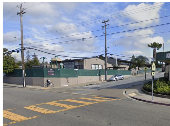
James Ave / Redwood Rd