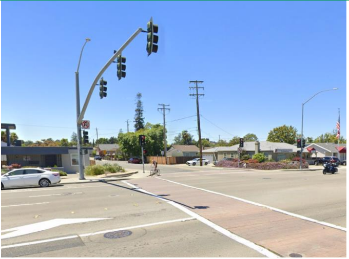
Lessley Ave/ Redwood Rd