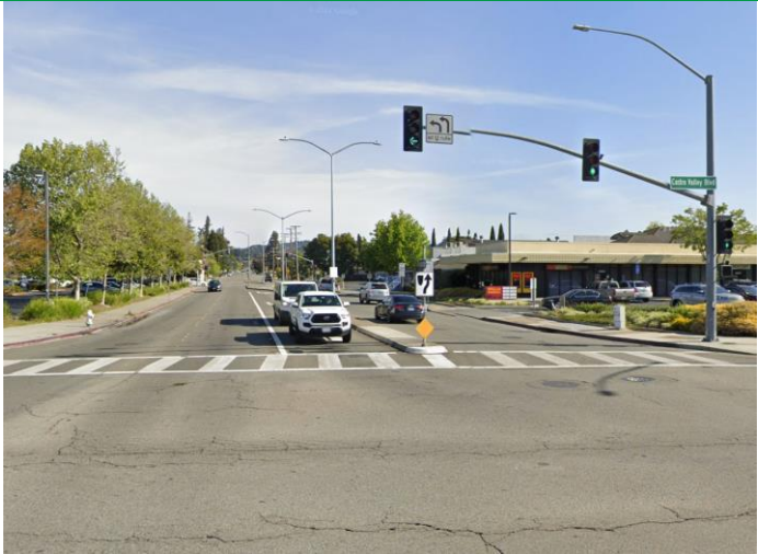
Castro Valley Blvd / Redwood Rd