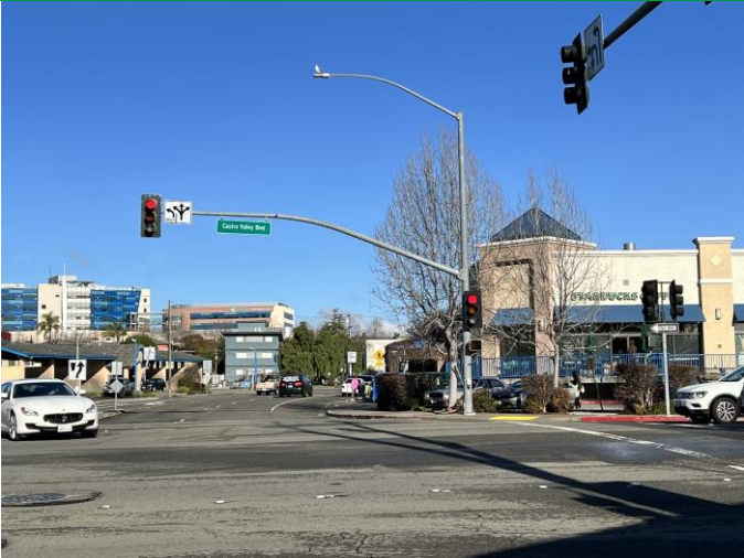
Castro Valley Blvd / Lake Chabot Rd