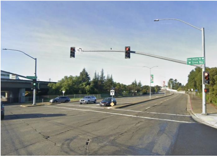
Crow Canyon Rd / E. Castro Valley Blvd