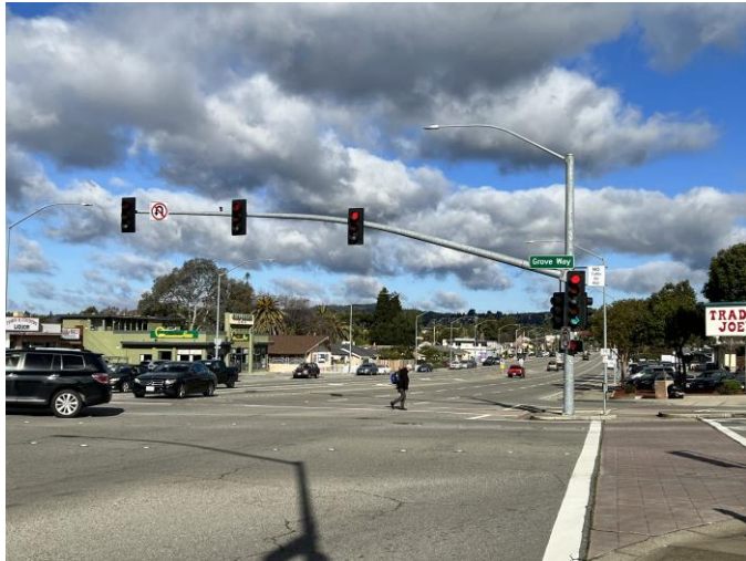
Grove Way / Redwood Rd