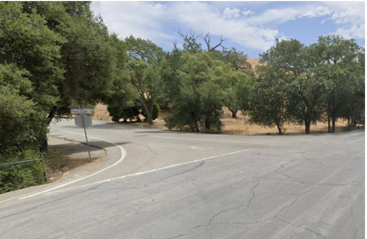
Koopman Rd / Pleasanton Sunol Rd