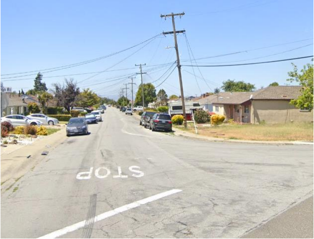
Bockman Rd / Keller Ave