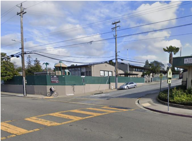
James Ave / Redwood Rd