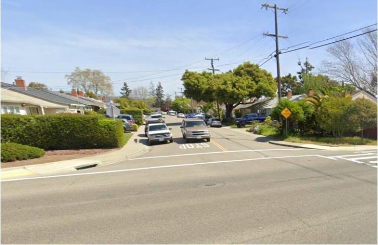
Lake Chabot Rd / Barlow Dr