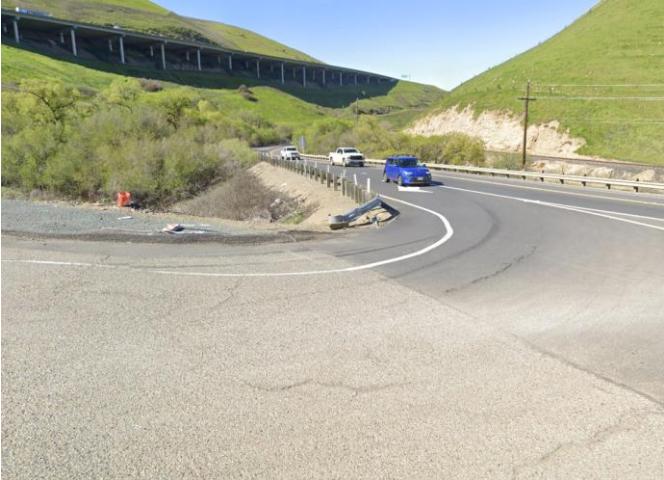
Altamont Pass Rd / Carroll Rd