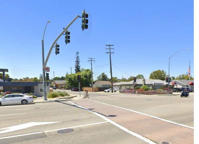
Lessley Ave/ Redwood Rd