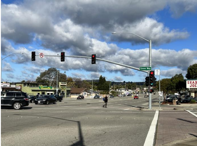
Grove Way / Redwood Rd